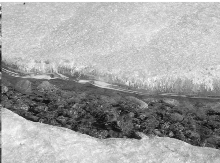
ice on the pecos river. pecos. 2005.