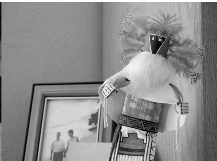
wisher. artifacts. arroyo hondo, santa fe. 2005.