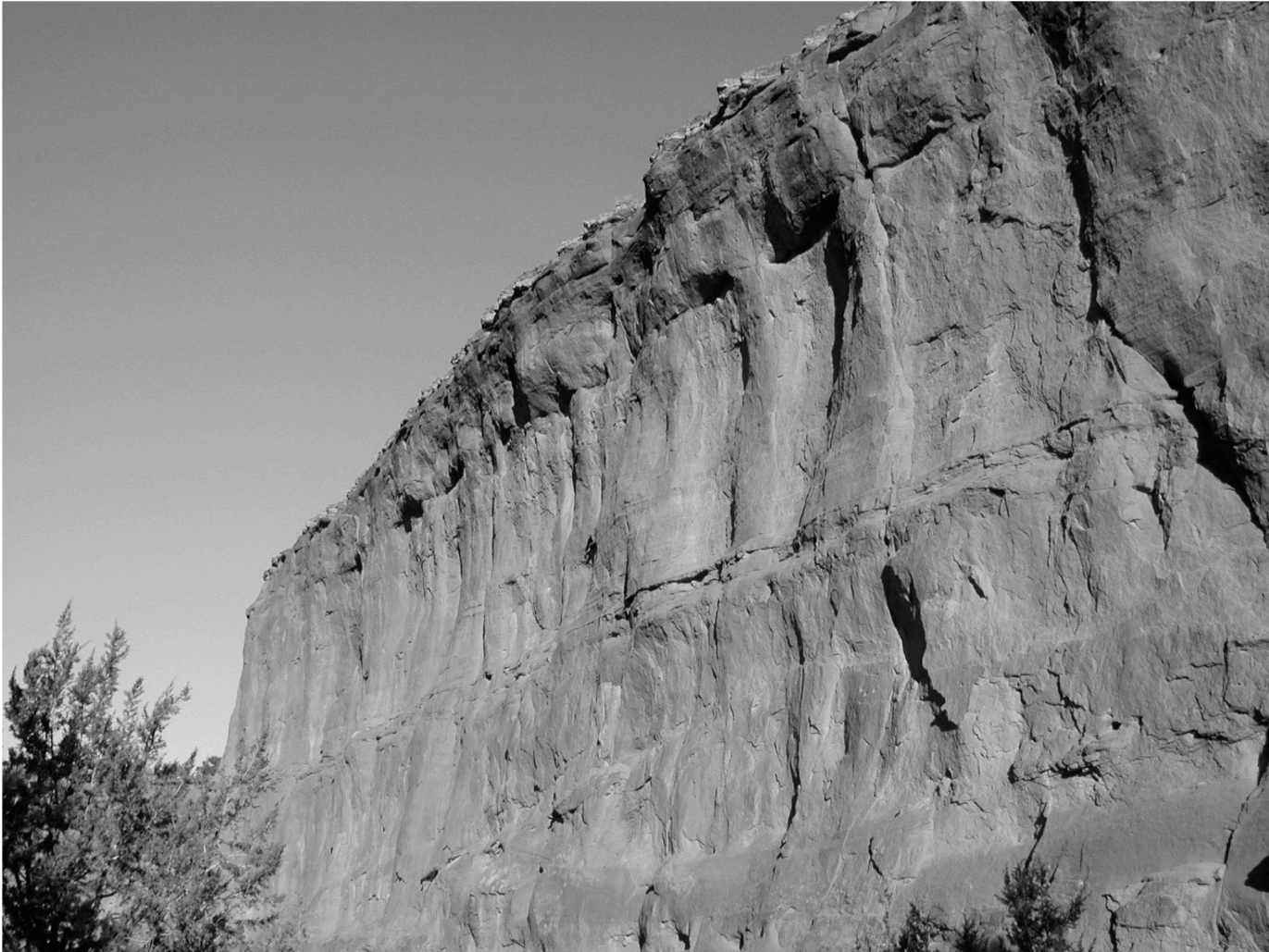
open road. cliffs. navajo reservation. 2001.