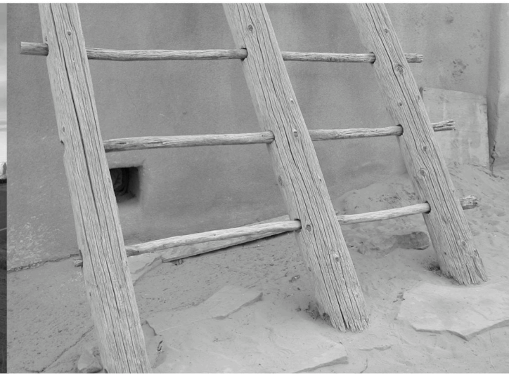
sky city. acoma pueblo. 2001.