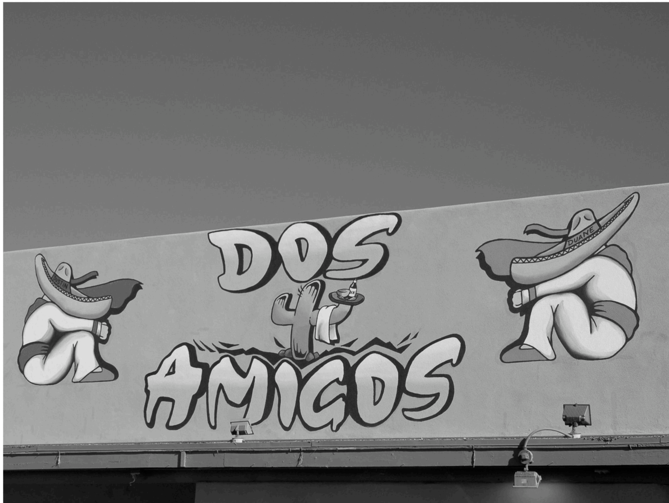
restaurant. tattoo parlor. española. 2005.