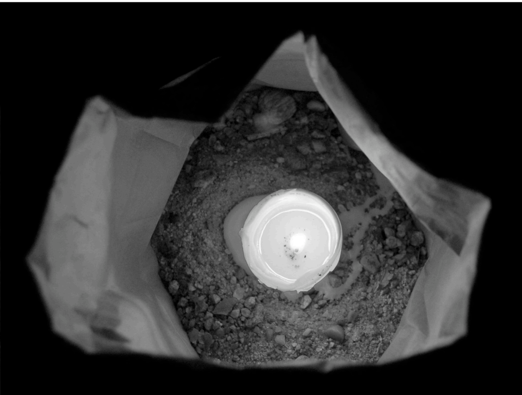
pinwheels. farolitos. canyon road, santa fe. christmas eve, 2005.