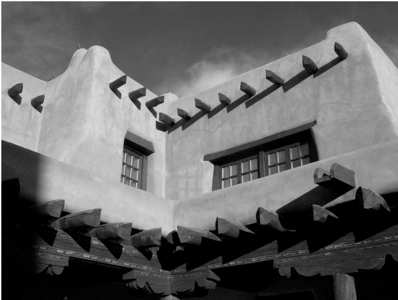
adobe rooftops. santa fe/pecos. 2005.