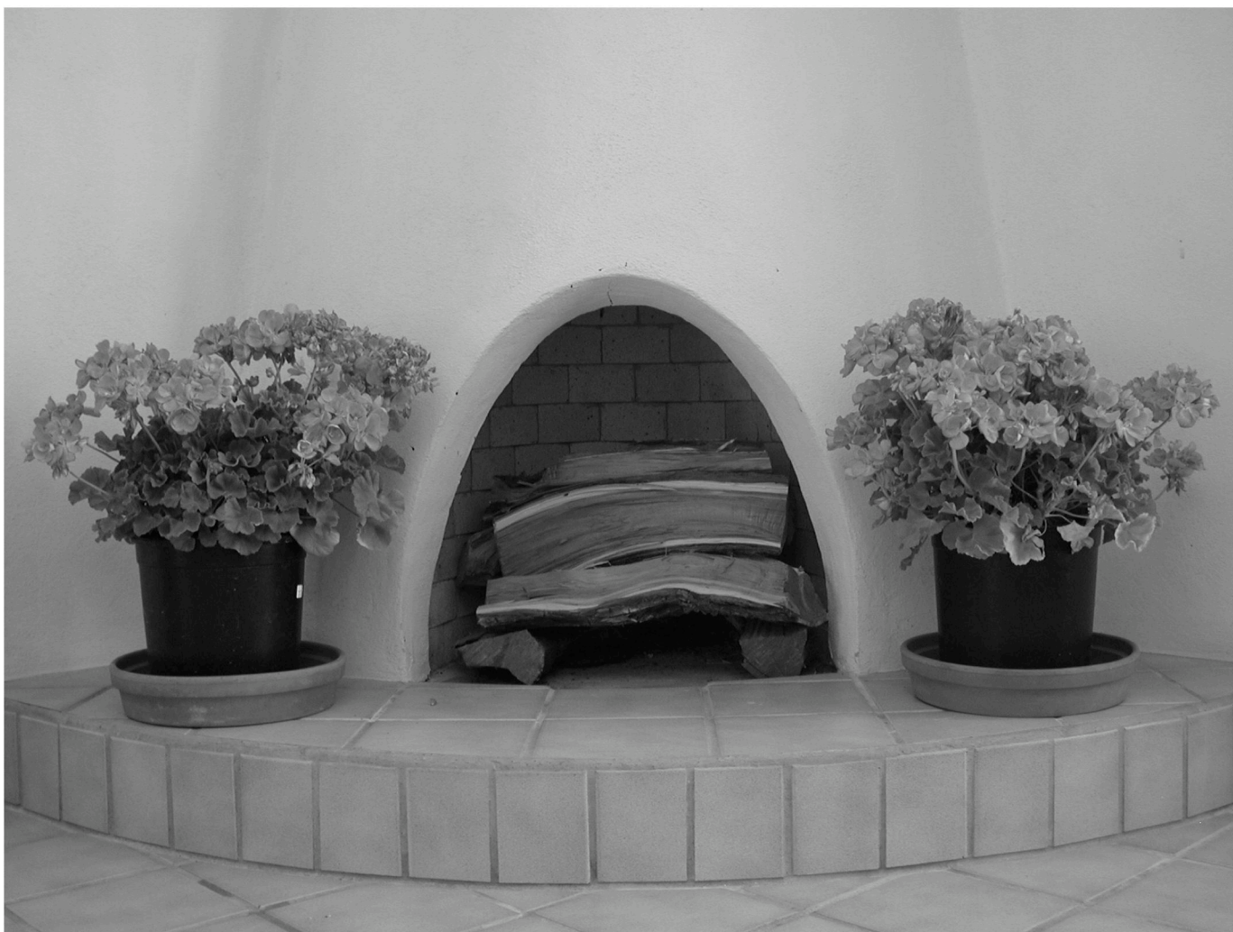
memorial. fireplace. arroyo hondo, santa fe. 2001.