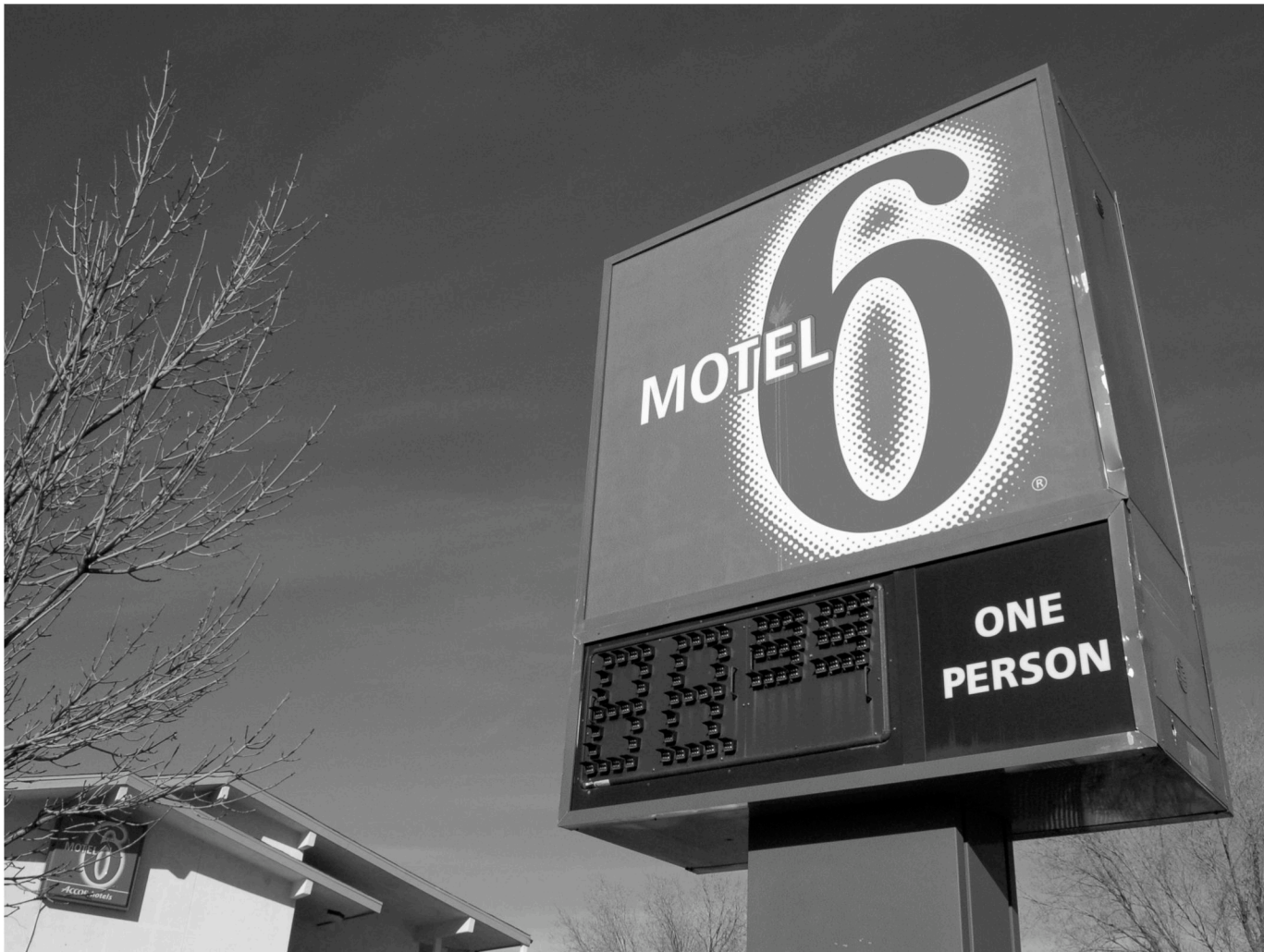
motels. cerillos road, santa fe. 2005.