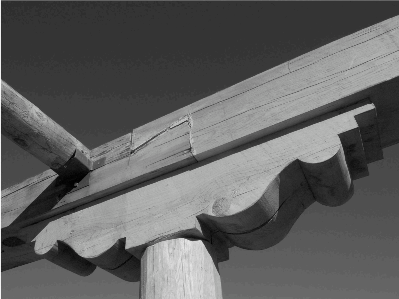
wood beam. mission ruins. pecos national historical park. 2005.