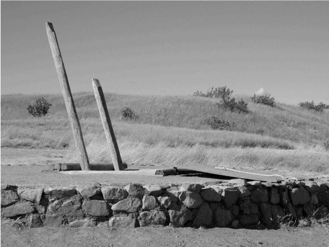
kiva. pecos national historical park. 2005.