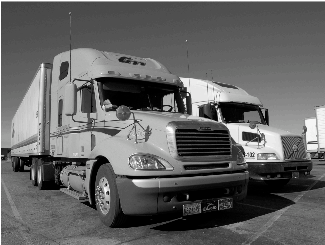
big rigs. gallup. 2005.