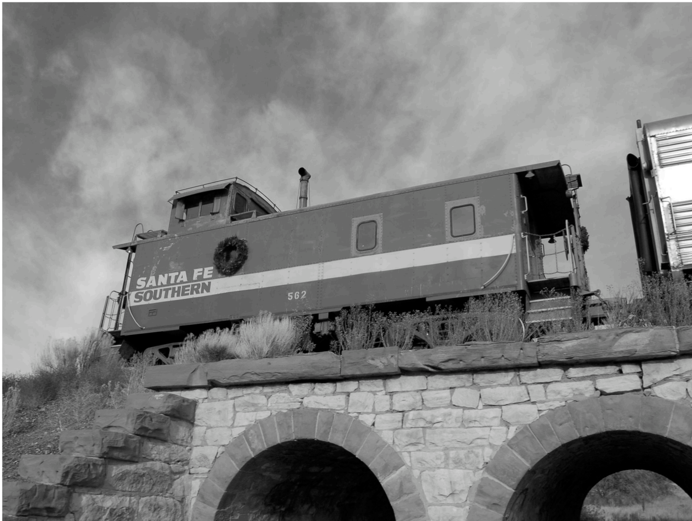
melted rock on tracks. caboose. arroyo hondo, santa fe. 2001/2005.